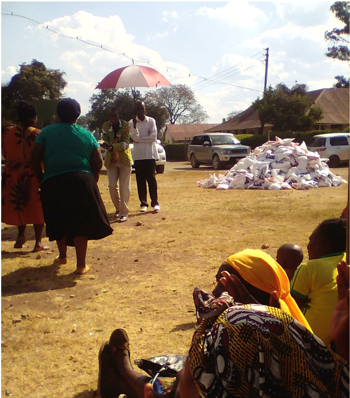
(Taken by Electoral Corruption and Fraud Monitors, work for Anti-Corruption Trust of Southern Africa)

The Table copies verbatim an article by Magoronga (2018) showing how political candidates are trying to manipulate voters in the run-up to the July 30, 2018 elections. As reflected in Table 2 below, the Redcliff candidate has mobilized doctors to give free medical treatment to the electorate. This has largely been viewed as vote buying.